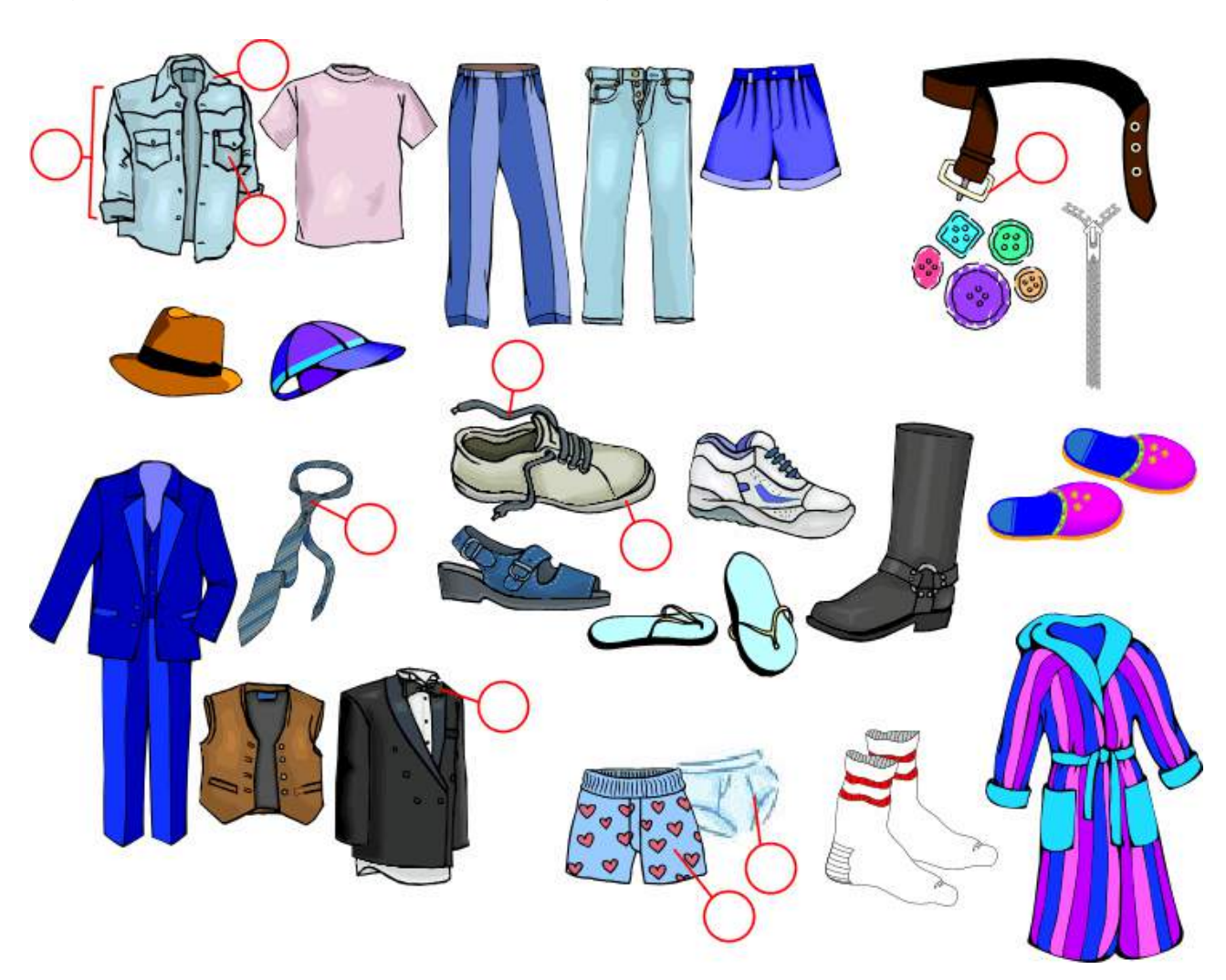
Activity Ten - Clothes shop Role Play.

In teams play Pictionnary using the images below. The other team has to guess the English word to identify what you are drawing as quickly as possible.